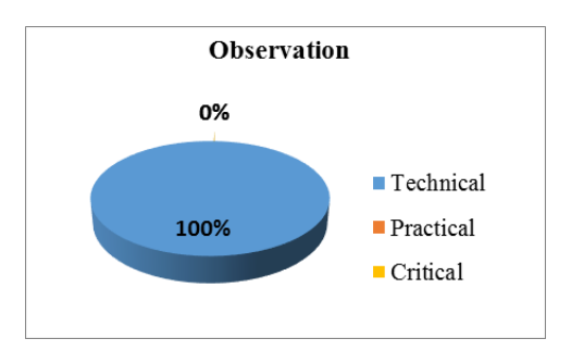
Fig.1: Rate of Reflection Levels in the PTC

commentaries to connect them to theories and principles of teaching and learning in both alternate and full time phases with (5 entries) and (8 entries) in that order. Figure 1 shows the rate of reflection levels in all phases of the PTC.