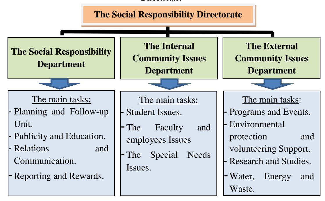
Fig.2. The proposed organizational structure for The Social Responsibility Directorate