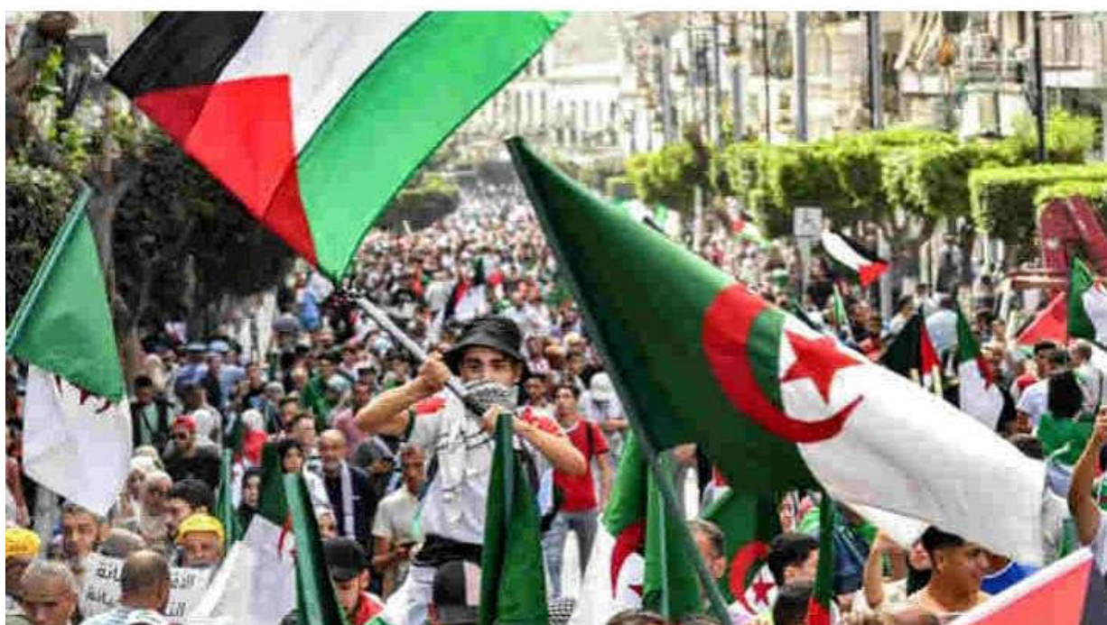
Algerian demonstration in supporting Gaza

call with his Palestinian counterpart, Mahmoud Abbas, to the effect that this statement is the official condemnation of the actions of The occupation and the call for an immediate end to this aggression, non-escalation in violence, and mobilization of countries around a clear and consistent position regarding the sanctity of this issue. Algeria also sought, in a UN Security Council meeting on the situation in the Middle East on October 25, 2023, to call for unifying voices to stop the aggression against Gaza, but certainly the blame is It had a decisive role in reversing this, and Algeria did not stop its support, especially in humanitarian aid and penetrating Israeli airspace to deliver relief to the Palestinians, in addition to submitting proposals to pressure Israel and other methods of international support. As for the internal level, the Algerian people carried out million-man marches that included More than 50 states supported Palestine and denounced the war against it. This support affected most newspapers, parties, organizations, and all student segments and others, so Algeria always seeks to remind people of the right of peoples to self-determination, given what they suffered during the French occupation. 15