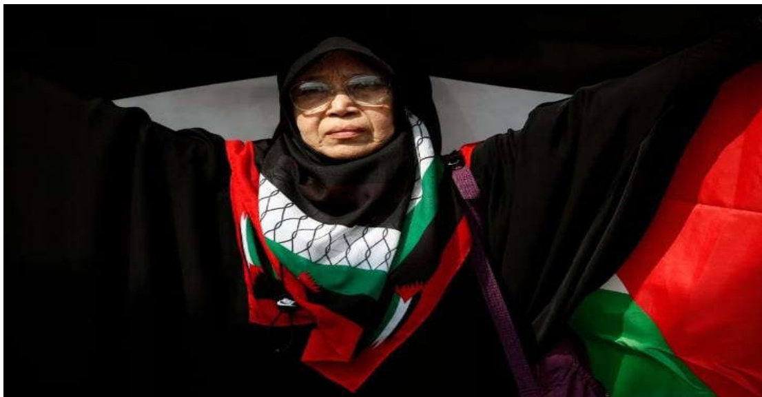
A Thai-Muslim demonstrator holds a large Palestinian flag during a protest calling for a permanent ceasefire in Gaza, at the US embassy in Bangkok, Thailand.

every call he makes since the beginning of the Al-Aqsa Flood operation. This is the same thing he confirmed in a report published by the Palestinian Press Agency of a call he made with Venezuelan President Nicolas Maduro, considering that the Palestine Liberation Organization is the sole legitimate representative of the Palestinian people, which he reiterated at the Cairo Peace Summit on October 21, 2023. He stressed the right of the Palestinians to the land and the necessity of finding a peaceful solution and rejecting violence with a policy and strategy that serves national interests and in a manner rationally, stressing that negotiation is the most appropriate solution instead of armed actions. This was made clearer in Al-Abbass's meeting with US Secretary of State Blinken 3 times after the Al-Aqsa Flood operation, indicating that the Palestinian Authority has nothing to do with what is happening between Hamas and Israel, and that the Palestinian government is ready to achieve security 14 coordination in the Gaza Strip in a way that serves peace and security for both sides.