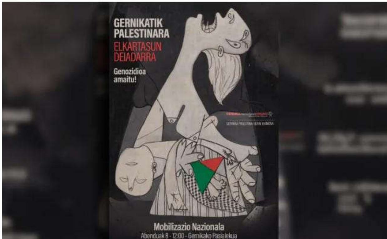
Spain's support for Gaza ( Gernikata )