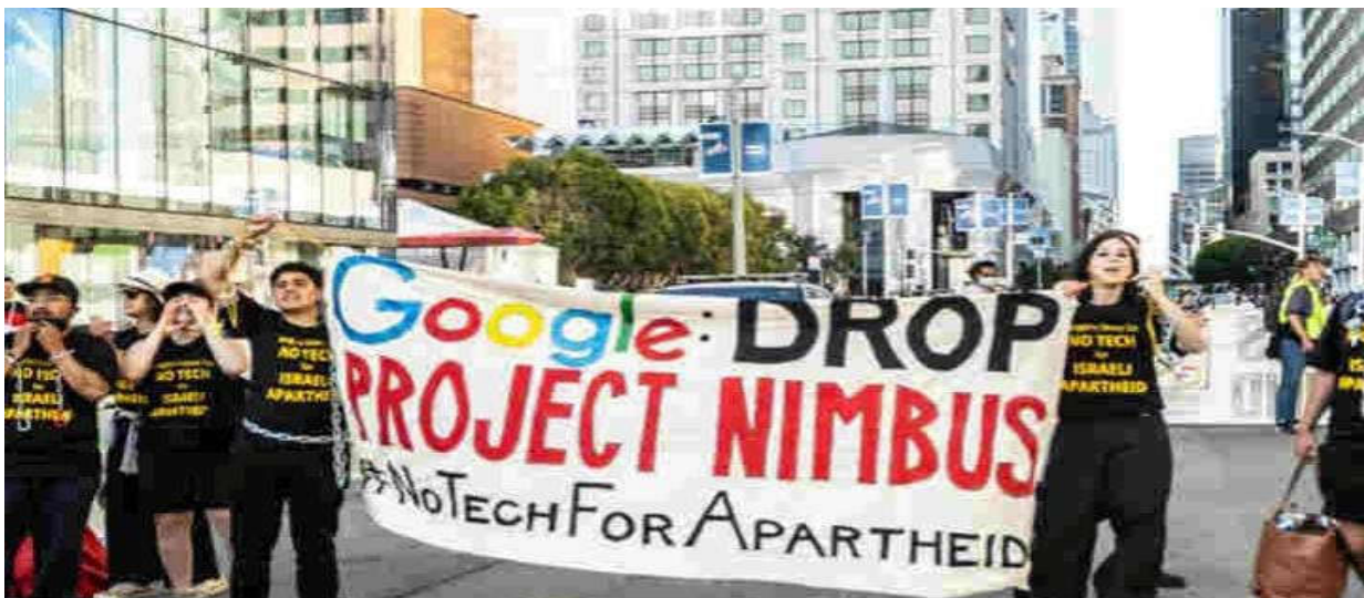
Demonstrations in front of Google headquarters to denounce the Nimbus project.

The demonstrations did not stop only in the form of support for the Palestinians, but rather went beyond condemning the major companies for arming Israel in its war and its genocide of the Palestinians. For example, protests rose loudly against Google in the “Nimbus” project, which calls for spying on the Palestinians and unfairly closing Israel’s privacy, which it will provide a large database for the occupation that enables them to spy on the Palestinians, in addition to all forms of boycott that affected major companies such as Coca-Cola, KFC, and other companies that help finance Israel militarily. 19