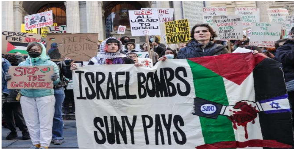
Student's demonstration in supporting Gaza in New york

right to veto resolutions in the Security Council against the American decision to support Israel militarily, materially and politically in its war on Gaza. The matter may even escalate into boasting .The United States, with its support for Israel under the pretext of eliminating terrorism 20