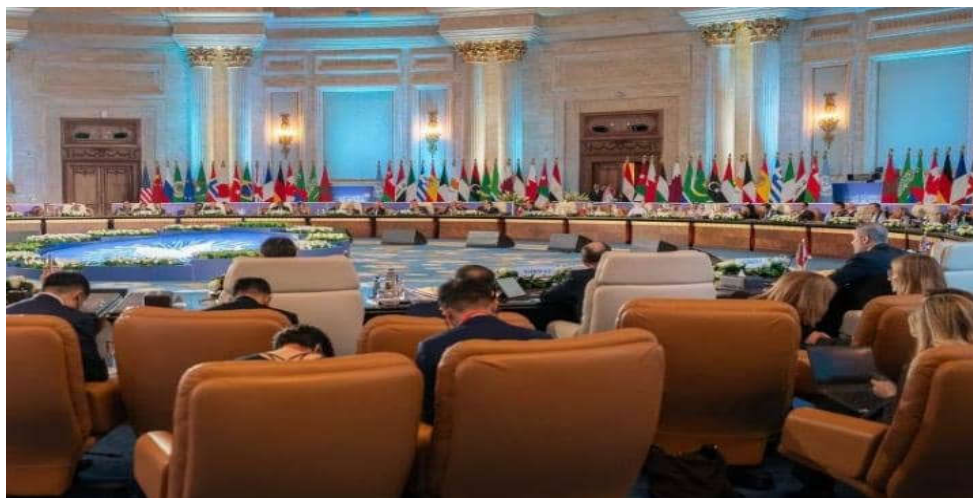
Cairo Peace Summit 2023

this is clear from the American indifference to the call and the West's lack of interest in stopping the war. 17