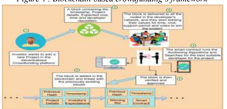
Figure 4 : Blockchain-based crowdfunding's framework