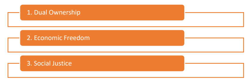
Fig.2: General principles of Islamic economics

began to talk about Islamic economics in the second half of the twentieth century, considering the essence and content of it this economy is linked to Islam since its inception. Like other economic systems, the economy in Islam is based on a number of principles that distinguish it from other economic systems, However, the Islamic economy is distinguished from the capitalist and socialist economy. they are represented in the elements below (Azrak, 2020, pp. 107-108):