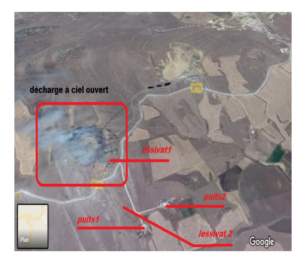
Figure .2 Sampling points.

These flasks were transported in a cooler whose temperature was between 4 and 6°C.