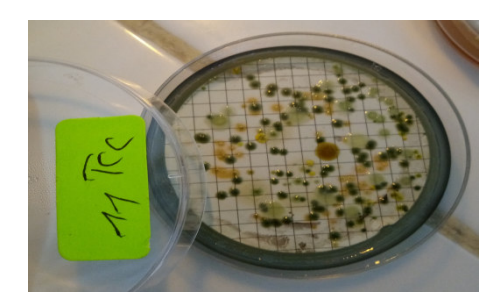
Figure.4 seeding results on 100 ml TCC of W2 water.

An example of agar seeding is presented by the following figures: