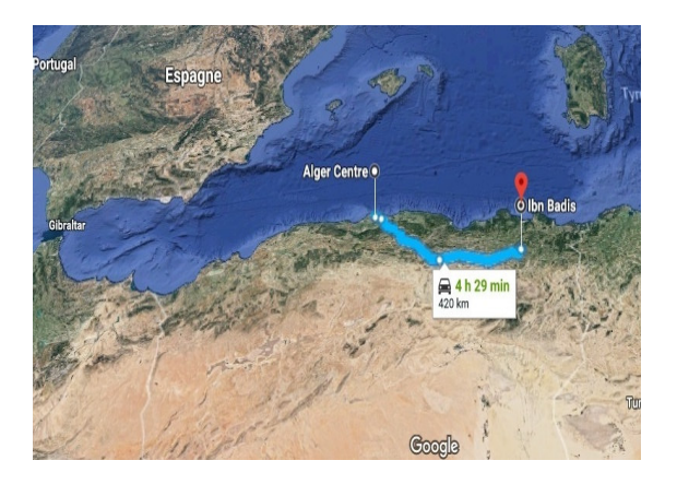
Figure 1. Localisation of the landfill.

The technical landfill is 4 km north of the commune Ibn Badis (El Haria) town which is about 40 km from the city of Constantine (north-east of Algeria). It was in operation in 2010 until 2015, its official closing date. It accumulated 1000 tons of wastes per year in 2015. Beyond this date the city wastes were transferred to the non-controlled landfill, next to the technical landfill as shown in Figures 1 and 2.