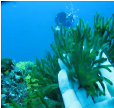
Fig.4.Codium fragile (2016).

Asparagopsis taxiformis (Delile) (Trevisan de Saint-Léon, 1845). According to Verlaque (1994) (Oceanology Center of Marseille-DIMAR), the species is present in Habibas Islands and is an introduced form coming from Australia and not the Atlantean-Mediterranean form. But it appears to be well integrated in the subtidal coral community up to the upper coralligenous level and is a major feature of the landscape (Dixon, 1964; Grimes, 2000). It also coexists in some places with Asparagopsis armata , but this one is more abundant (Hussein, 2015) (Fig.6).