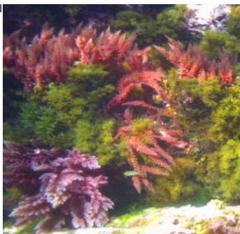
Fig.6. Asparagopsis armata (lower left) and Asparagopsis taxiformis (upper and lower right) (2015).