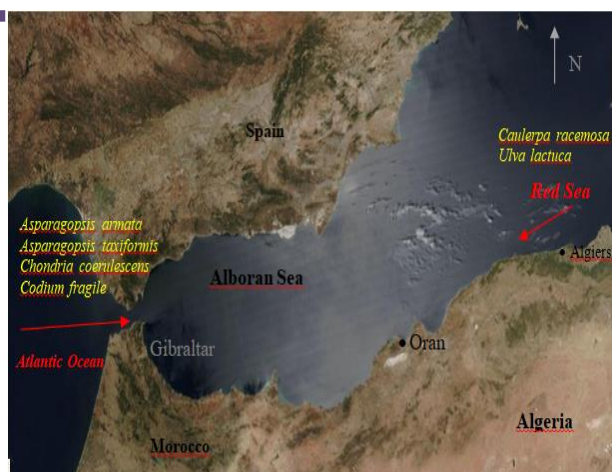
Fig.7. Pathway and origin of the invasive species of Oran.