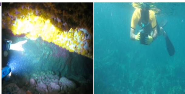
Fig.3. Observation (photography and underwater video) in situ.

The identification and classification of species were done according to FAO species identification sheets, as well as other scientific documents in the field (Boudouresque, 2005; Pergent et al., 2007; Barcelona Convention, 1976). Digital photographs were also taken to facilitate species identification. For species of conservation interest, Annex II and III of the Barcelona Protocol on Specially Protected Areas and Biological Diversity of the Barcelona Convention have been used (Barcelona Convention, 1976). The observations noted in situ and also from underwater photographs analyzed could constitute a basic data to establish a first blacklist of non-native species reported in Oran coast.