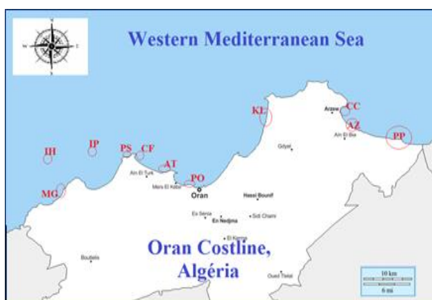
Fig.1. Overview of the coastal and marine environment of Oran coastline and positioning of the sampling stations: 1-Port Au Poules (PP);2-Arzew (AZ) ;3-Cap Carbon (CC) ;4-Kristel (KL) ;5-Oran harbor-Monte Cristo (PO) ; 6-Ain Türk (AT); 7-Cape Falcon (CF); 8-Pain Sucre-la Madrague (PS);9- Plane island (IP);10-Madagh (MG) et (IH): 11-Iles Habibas.

The Oranian coastline is located along the southern shore of the Mediterranean basin (Fig.1); also called Alboran Sea is located in North-West of Algeria at 432 km from the capital Algiers. It is made up of 70% of rocky coasts and 30% of sandy coasts; the West sector is characterized by rocky character beaches: Ain Türk, Cape Falcon, la Madrague, les Andalouses, Madagh in the form of steep cliffs sometimes delimited by caps with an island complex (Plane and Habibas Islands) that are clearly visible in this region. In the East, the Macta (Arzew Gulf) is limited to the West by Cape Carbon (35° 45'N 20' W) and to the East by the Cape Ivi (36° 37'N -0 13'W) where we can find a long arched sandy beach that ends with the large terminal (harbor) of Bethioua for liquefied natural gas. From this last point the rocky character spreads to the North until the islets of Arzew and extends to the West to Cape Carbon (Hussein, 2015). The continental shelf is very small with a steep slope that is interrupted by numerous rocky bottoms deep and not well suited for trawling activity (Hussein, 2015).