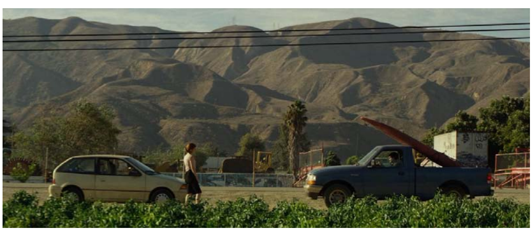
Fig. 4. Mae and Spencer, with nature as a background