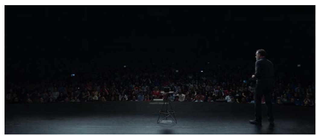
Fig. 3. The Circle's CEO introducing SeeChange to the audience

SeeChange. The latter revolves around implementing very tiny cameras everywhere in private as well as public spaces to collect data from different scenes. Using satellite connectivity, the company aims at acquiring, analysing, and storing the information for a usage, they promote as benevolent and promoting to human life and condition. In Fig.3., through a crowd-shot, the emulator and personifier of tech-giant leaders announces SeeChange and swiftly puts into practice what he thinks of as a revolutionary product that would ultimately promote human rights by eliminating totalitarianism and preserving freedoms. For him, "Activists no longer have to hold up a camera" (Ponsoldt, 2017, 00:16:27). All the job will be concentrated at the company and in a way The Circle declares itself as the only entity capable of taking the human destiny into the ideal safe place.