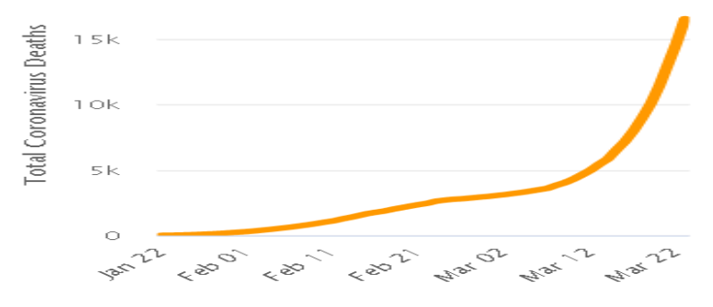
Source: "COVID-19 CORONAVIRUS / CASES." Worldometers.info. 24 Mar. 2020. Web. 24 Mar. 2020. <a href="https://www.worldometers.info/coronavirus/coronavirus/cases/">https://www.worldometers.info/coronavirus/cases/</a>>.

The figure above shows a continuous increase in the number of coronavirus deaths worldwide. Reaching the number in the thousands is a dangerous indicator that reflects the seriousness of the threat this virus poses to the whole world.