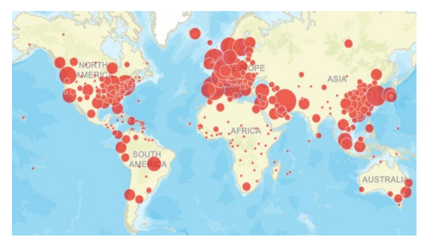
Fig 1. Map of the spread of COVID-19 across the globe

At the end of December 2019, Chinese public health authorities reported several cases of acute respiratory syndrome in Wuhan. The initial outbreak in Wuhan spread rapidly, affecting other parts of China. Cases were soon detected in several other countries. Outbreaks and clusters of the disease have since been observed in Asia, Europe, Australia, Africa, and the Americas.<sup>9</sup> This means that the virus has spread to five continents, as shown on the map below