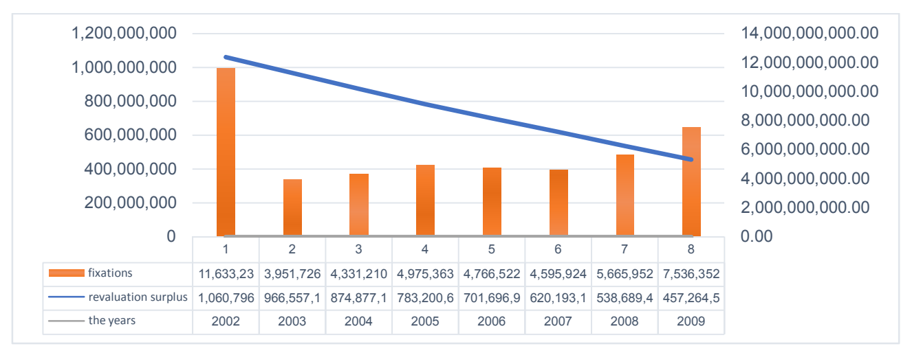
Figure No. (02) shows the evolution of the total assets of the Saidal Group Corporation during the period

Financial indicators of Saidal Complex CorporationThrough the budget, we can monitor some indicators about the total fixings and the revaluation surplus through the figure that shows the evolution of the total fixings of the Saidal Complex Corporation during the period from 2002 to 2009.