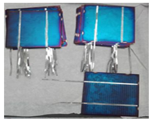
Fig 6. The cell