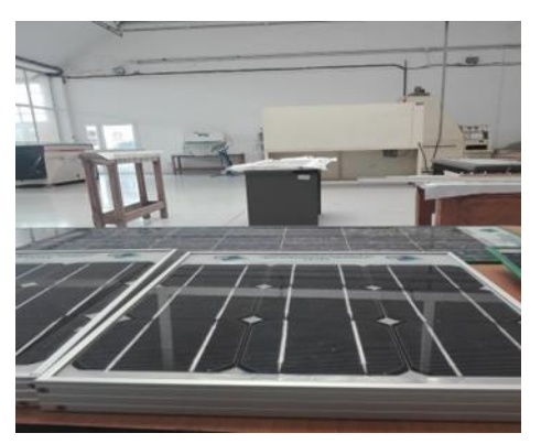
Fig 8. The aluminum frame