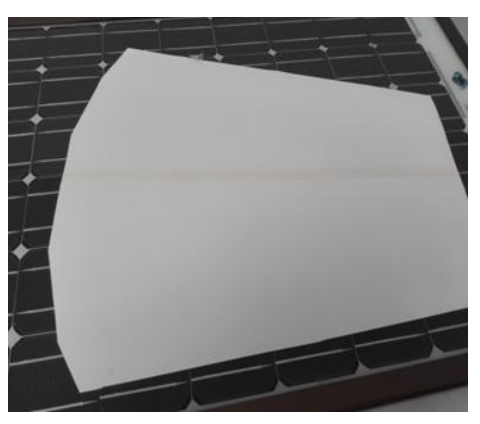
Fig 7. The backseet