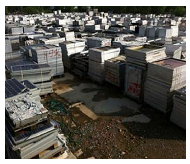
Fig 1. Waste PV panel

Up to day, the crystalline silicon is the more use semi-conductor for photovoltaic applications with more than 90% of the total photovoltaic technology as mono or polycrystalline silicon. The exponential grow of photovoltaic panels highlights the necessity to cope with the environmental impact which could raise from wrong practices for disposal of end of life photovoltaic modules (Fig1.), the amount of waste PV panel is estimated to reach in 2030, 30 million tons (Fig 2.) [1].