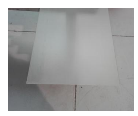
Fig 4. The glass