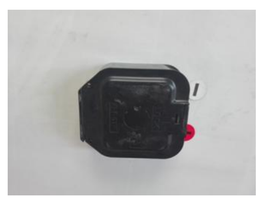
Fig 9. The junction box

The composition of PV modules varies according to the used technology. The average composition of a current c-Si module is representing in the table 1, this important quantity of materials can be recycling and reused using different methods. The largest fraction of components material is class and its represent the largest fraction of recovered material which is mainly used in recycled glass industries.