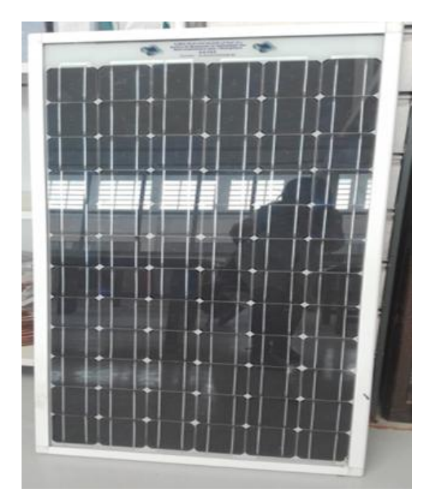
Fig 3. Silicon based photovoltaic panel (CRTSE conception)

The junction box (Fig 9.) is a small weatherproof which protects the connections and provide a safety barrier.