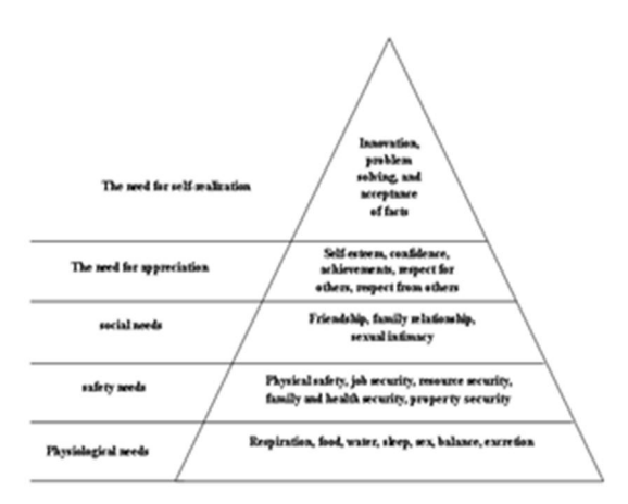
Figure 1: Maslow's pyramid of needs gradation

When we talk about the necessary needs of man, Maslow's pyramid was the first thing that comes to mind because this pyramid came as a result of scientific research and psychological theory produced by this scientist in a research paper as shown in the following figure.