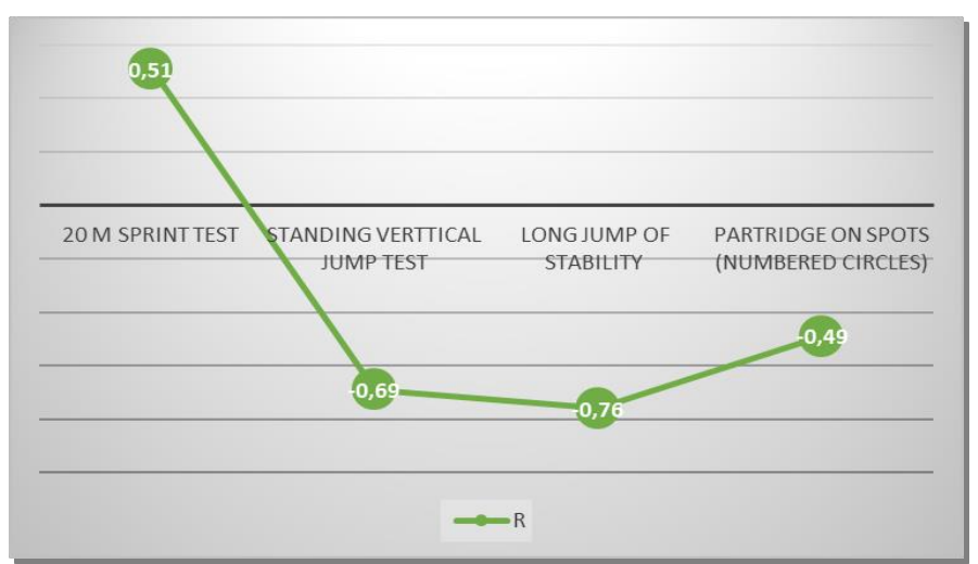
Figure (01) the graph of values of correlation coefficients between Transitional skills and ADHD.

It is clear from Table (01) and figure (01) that The correlation coefficients between Transitional skills and ADHD were estimated in the following order: 0.51, -0.69, -0.76, -0.49, which is a statistically significant at the significance level 0.05, Which confirms the existence of a statistically significant relationship between Transitional skills and ADHD, and this direct positive relationship (in 20 m Sprint Test) is statistically explained that the greater Transitional skills increases ADHD increase, but actually the test of 20 m Sprint used in the study As its numerical values increase the Transitional skills performance will be weak, hence we deduce from test that by an increase of ADHD, the accuracy of the performance of Transitional skills, but by reference to the type of relationship between The two variables we find it a negative relationship and unlike this result is explained in adhd test as: the numerical value indicates that the smaller the numerical value or the total summation of this test, the greater the disorder in the adhd will be and the more the numerical value is, it indicates that the child does not suffer from adhd.