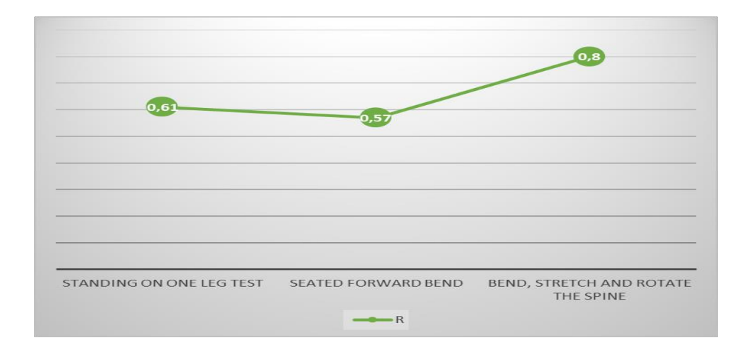
Figure (02) The graph of values of correlation coefficients between Nontransition skills and ADHD.

It is clear from Table (02) and figure (02) that the values of correlation coefficients between Non-transition skills and ADHD ranged between 0.57 and