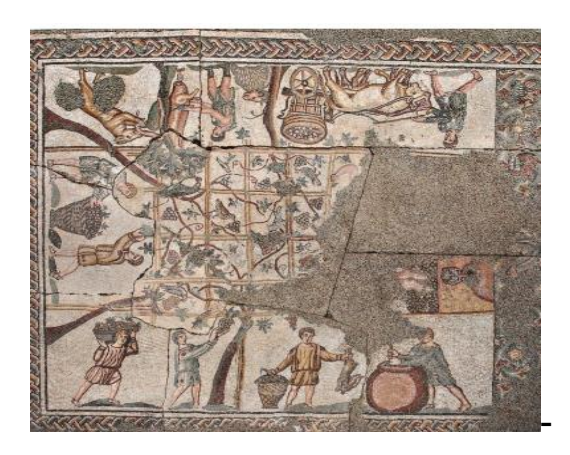
Fig.2.A mosaic of rural activities and their transformation into alcohol by the locals, Nabila Sreih, Ibid, p. 23.

The third mosaic painting depicts daily life in the summer and dates back to the fifth century AD<sup>25</sup>, where the scene of grape picking is presented. The painting features a frame decorated with geometric and floral motifs. The main scene in the painting, is setting the grape tree on a structure made of reeds. It centers around the work of the peasants while they are busy picking the fruits and putting them in baskets, as well as crushing them to extract the juice and turn it into wine.<sup>26</sup>