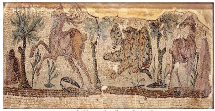
فسيفساءالحبوانات البرية Mosaïque à décor animalier