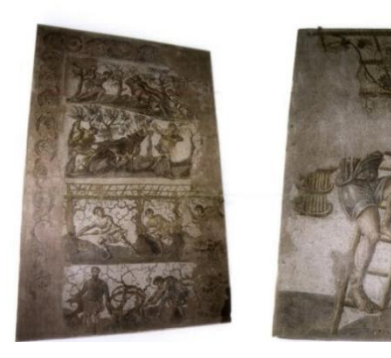
Fig.1.Sabah Ferdi, op.cit, 2005;

We also find the scene of the process of harvesting grapes, Vendanges. In the upper part of the painting, the Vendangeurs grape-picker appears in the upper part of the painting, a trellis of reeds, and the leaves of the vine are green and free from bunches in the lower part of the trellis. The grape picker is shown using a ladder made of wood. The grape picker wears short gray-green robes with brown spots. He walks barefoot and places the harvested bunches in baskets made of witch hazel and coated with tar from the inside to ensure their stability when they are placed in larger baskets on the ground.<sup>24</sup>