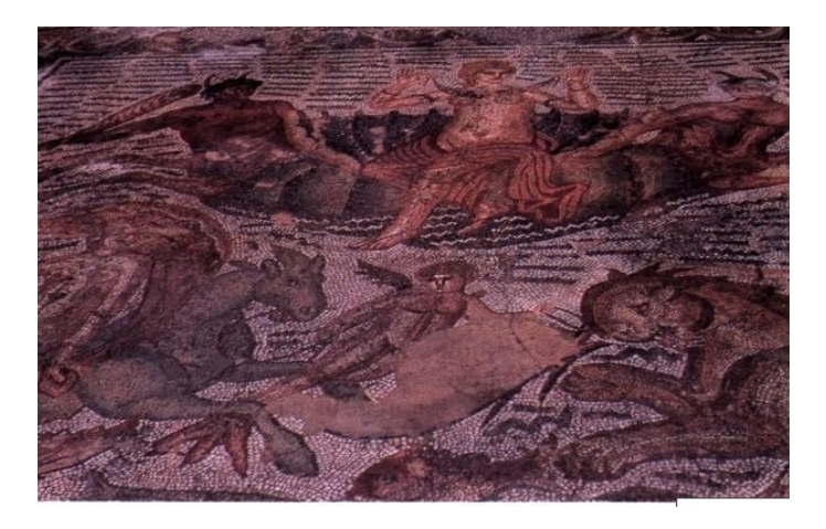
Fig.7. Sabah Ferdi, Uneven state of conservation of Algerian mosaics, C.R.S.A.I.B.L, 145 Year, N°1, 2001, p527

It is considered one of the most beautiful mosaic pieces preserved at the level of the museum. It represents the bathing scene of Venus, the goddess of love and beauty and the goddess of fertility among the Romans, who occupies the first place among the goddesses. Her pictures are spread in most North African sites, east and west, as the number of mosaics in which the goddess Venus appears in various positions and forms is approximately 22. She appears in this painting sitting on a coquille shell<sup>36</sup> in a cheerful atmosphere with mythical scenes, characterized by several marine creatures and various scenes.