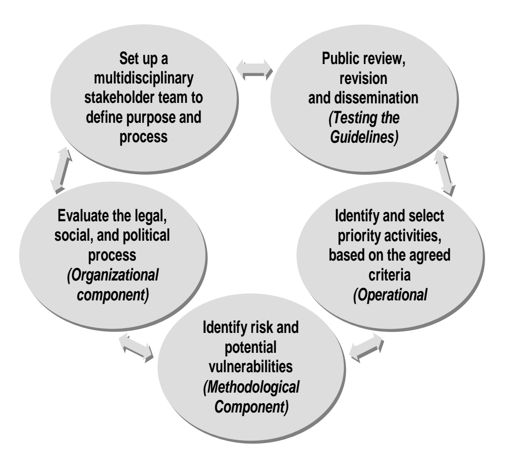
Fig. 1. Development and revision of the guidelines for drought management plans.

evolve, new programs are developed, and institutional responsibilities change, these plans have to be revised. However the proposed drought plan is the result of more than three years of research and it should be considered as an integrated drought plan, which takes into account almost every aspect of mitigating drought for the time being. It is true, though that from time to time it should be reviewed and probably edited and updated.