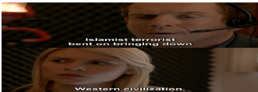
Fig.6. The proclaim of Sergeant Nicholas Brody about the plans of radical armed groups against the United States. Homeland, 2011-present

In the first episodes of the drama series, Sergeant Brody initiated the idea of the diversity between both civilisations (Fig.6.). While proclaiming to the plans of radical armed groups against his country, Sergeant Brody referred to the United States as ‘the western civilisation’. This, indeed, indicates that the western civilisation is represented by the United States; and any terrorist plans against it, is regarded as an aggression against the whole western civilisation. Besides, the usage of the term ‘Islamist’, in this context, infers to the audience that the terrorist attacks are always linked to individuals who claim adherence to Islam. On Semiotics level, while he was announcing his claim, Sergeant Brody and the assistant agents of CIA appeared with serious gestures as to transfer to the audience that the speech is official. Without any further voices in the background, the focus of the audience is attracted to the speech of Sergeant Brody.