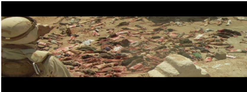
Fig.1. A scene showing the demise of 83 Yemeni protestors by the American Marines, Rules of Engagement , 2000

engagement during battles. The story is about Colonel Childers, the best friend of Colonel Hodges, who is charged with murder by a Marshall court for executing 83 Yemeni protestors, including women and children, who were protesting near the American embassy in Sana'a, Yemen, against the American presence in their country (Fig.1). As a lawyer, Colonel Hodges attempts to defend his best friend from the charges of murder; claiming that the crowd carried weapons and they opened fire on the Marines first. At the end of the movie, Colonel Childers was found not guilty by the Marshall court for executing 83 civilians.