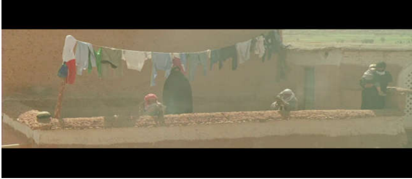
Fig.3. A group of armed individuals shooting towards the American embassy with women and children in the background. Rules of Engagement , 2000

standing American Marine, who is looking into the accumulated dead men, women and children.