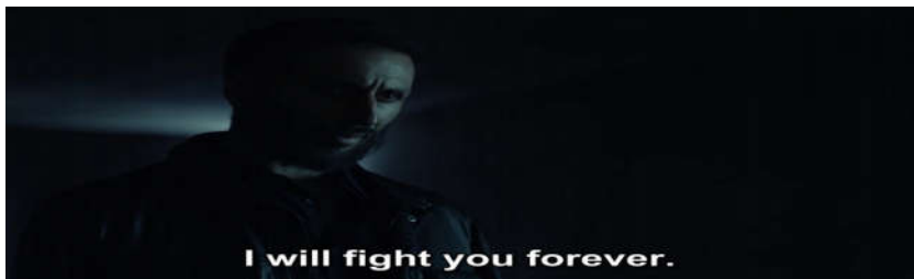
Fig.8. A leader of a radical organisation expressing his attitudes to a CIA special agent. Homeland , 2011-present

Interestingly enough, Homeland represented certain speeches of radical individuals to transmit its ideological outlook of the future coexistence between Arab Muslims and the United States (Fig.10.). The drama series attempts to use such viewpoints to convey the idea that their struggle with Muslims is on-going because it is part of their faith. Pictured in complete darkness, the leader of the radical organisation is expressing his attitudes and plans against the United States. The scene of darkness infers to the audience that expectations and presumptions of future terrorist aggressions seldom found, unless revealed by the CIA; therefore, the image and the discourse of CIA agents, in the drama series, should be regarded true and valid.