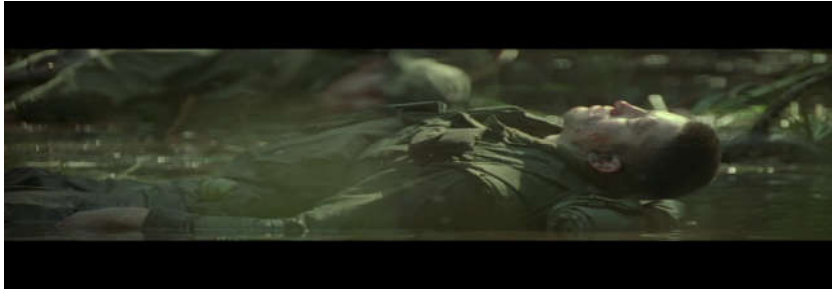
Fig.2. The opening scene of the movie showing the death of American Marines in Vietnam, Rules of Engagement , 2000

territories is regarded as a national duty. It also triggers the sense of revenge and patriotism among the audience as the movie shifts directly after this scene to the Yemeni context.