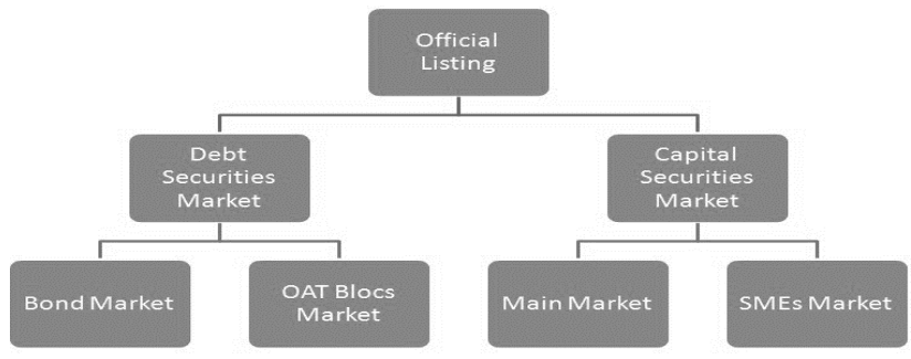
Figure 1. Organizational chart