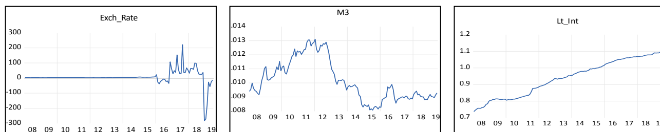
Fig 2. Graph of time series