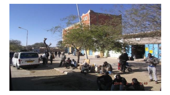
Photo No. 01 : African migrant groups are looking for work on the sidewalks of the Tahaggart west

3.3. Illegal trade is the most important activity of African migrants.