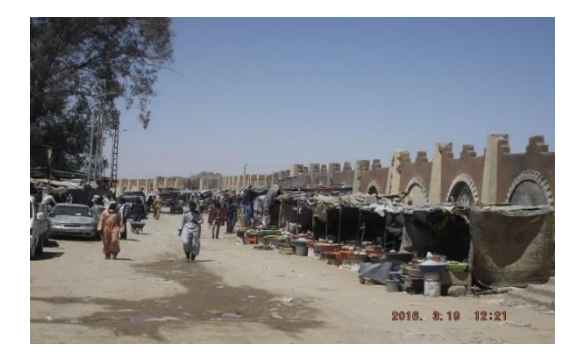
Photo No.02: The illegal migrant market (Souk El-Souadine) in front of Al-Saffsaf market in Gata-Eloued district- Source: LENSARI, March 2016.