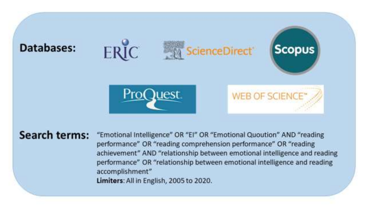
Figure 2. Example of the Full Search Strategy.