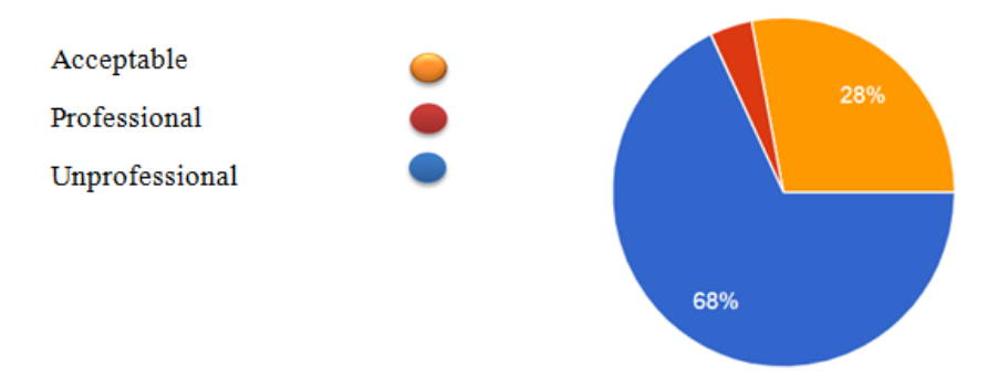
Fig 3.Summary of responses regardingTeaching methods for journalism students in Algeria.

According to 68 percent of responses think that the Teaching methods for journalism students in Algeria are Unprofessional and are not successful to prepare a professional journalist that opens the way for questions about the effectiveness of these methods and their ineffectiveness in forming professional students in the field of media and communication If there are problems with teaching, how to reach the knowledge to students. While 28 percent see that the Teaching methods are Acceptable and the issue of this problem is the lack of attention of internships and formation side during the study. Other 4 percent see that Teaching methods are professional.