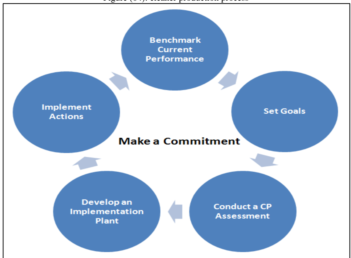
Figure (04): cleaner production process